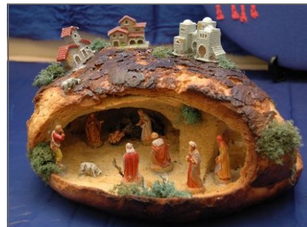
A tradition by a baker in the island of Gozo is to carefully create this crib, or scene from the nativity of Christ, inside a hollowed out loaf of crusty Maltese bread.