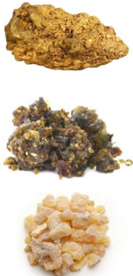
The three gifts of the Magi: Gold, Myrrh and Frankincense, an interesting analogy with the 3 BG3 qualities.

“We can choose to allow the sacred Nativity story to be re-enacted in our hearts at this time, allowing the influx of powerful spiritual energies into our heart centre and our consciousness”.